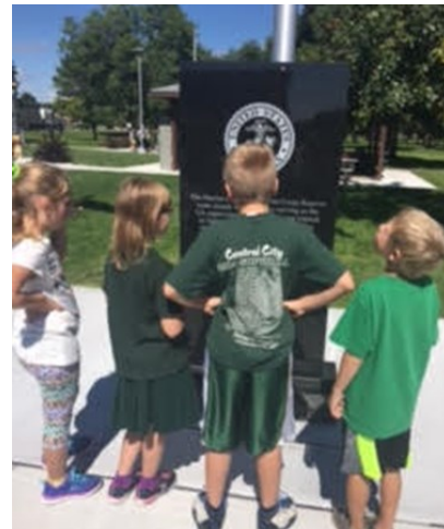
Third graders connect with Fort Worth Zoo to learn more about animal adaptations. Here they are learning about how a frogmouth bird "Stumps" its body to camouflage itself amongst trees.